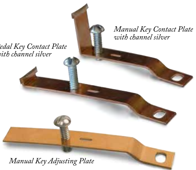
Manual Key Contact Plate with channel silver

There are two types of phosphor bronze key contact plates: • Both are tipped with channel silver. • Manual key contact plate is for manual contact block rails. • Pedal key contact plate for pedal underkey contact rails.